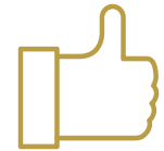
Rental car privilege