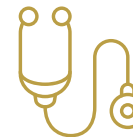
Emergency medical expenses