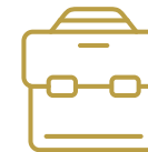
Personal belongings cover