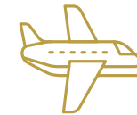
Free airport pick-up and drop-off